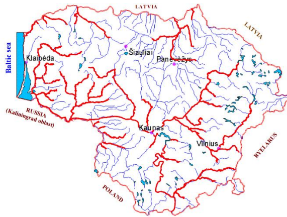
Picture 1. Lithuanian rivers exempted from damming/hydropower development